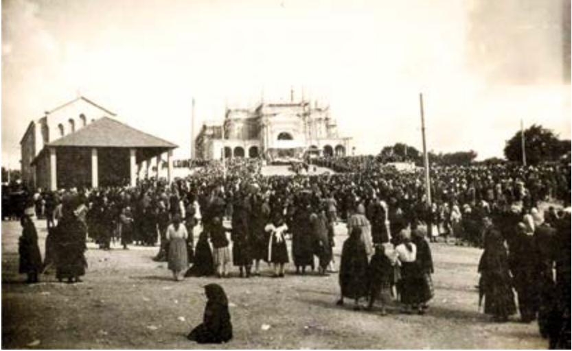
Basilica in Fatima under construction

The life of Sr. Lucia in Carmel was one of self-immolation and continuous spiritual suffering. From 1950 onwards, one can find such statements in her letters as “I am pained that the consecration of Russia has not been done as Our Lady requested it.” In 1955, Sr. Lucia was reduced to silence, and without the express permission of the Holy See, no one could meet and speak with her. As long as she was able, she had spoken and written about the trials to come. Although she was not allowed to reveal the third part of the secret, Sr. Lucia now realized that the prophecies announced in it were to be fulfilled before her eyes. Even if the disastrous realities of the Second Vatican Council and its reforms were directly concealed from her, through the visits of her relatives (amongst whom were also priests) she could sense the “diabolic wave which overflows the whole world,” and many times she spoke about “the last and final battle between the devil and Our Lady,” about the strategy of